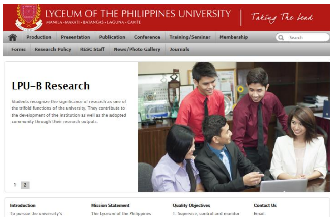
Figure 3: Institutional Research Home Page

The following figures presented in the discussion are sample of screen shots of the research web pages. The layout of the webpage is very similar to the University website for consistency of themes.