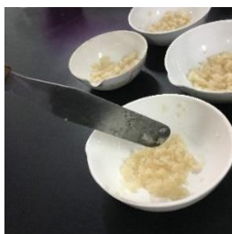
Figure 2. R. raphanistrum root extract

One hundred grams of R. raphanistrum root were used for the extraction which yielded to pale yellow, dry clumps of residue as seen in Figure 2 which is also similar with the study of Jakmatakul, Suttisri and Tengamnuay (2009) using hexane extract which gained 4.21% w/w. The extract obtained in the experiment weighed 7 grams and has a total percent yield of 7%.