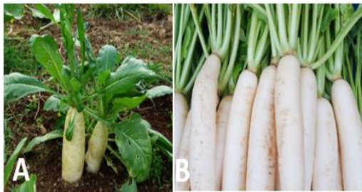
Figure 1. R. raphanistrum (A) whole plant (B) Root Crop

treatment for STH infections. Mebendazole and albendazole are the most frequently used drugs to treat these infections; pyrantel embonate and levamisole can be used as an alternative (Bethony et al., 2006). Pyrantel is broadly used in Southeast Asia and Latin America for various helminth control programs (Albonico et al., 2008). Pyrantel embonate releases acetylcholine and inhibits cholinesterase leading to paralysis of helminths (Lloyd et al., 2014). Though current anti-helminthic drugs on the market demonstrated high effectiveness, side effects are still determined in clinical setting. Different side effects such as gastrointestinal upset, headache, dizziness, hypersensitivity, alopecia, pancytopenia, leukopenia and elevation of liver enzymes had been reported in some clinical literatures (Gulani, Nagpal, Osmond, & Sachdev, 2007). Thus, studies are being rendered to think of new substances from plants that are safe and tended for humans, acting as anti-helminthic which have the best source of bioactive substances capable of killing helminths (Nunomura et al., 2006).