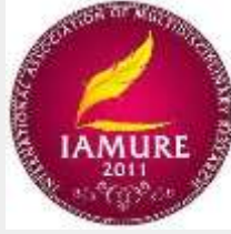
International Association of Multidisciplinary Research