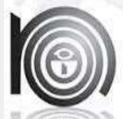
Network of CALABARZON Educational Institutions