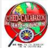
CALABARZON Research Council